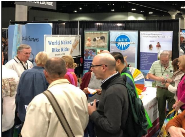
The very busy AANR-West booth at the LA Travel and Adventure Show.