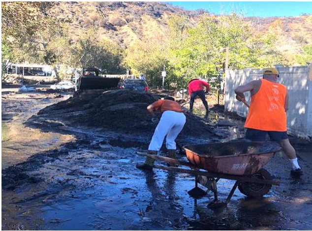
The view of the mud and debris along Low Road near Indian Creek.