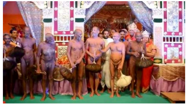
Skyclad Jain monks