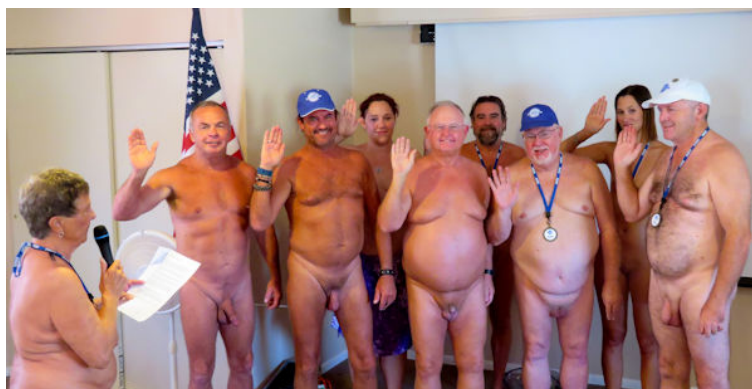
Photos of Regional convention held at De Anza Springs Nudist Park, Jacumba, California July 28-30, 2017. Right: Swearing in of officers and new members of the Board of Directors.