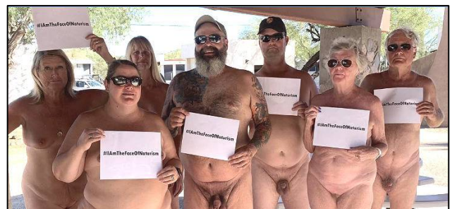
The above images are screen shots from the Clothes Free videos #366 and #367.

These videos may be seen at: https://clothesfree.com/videos There is a CFI membership fee required for viewing.