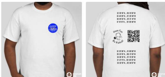
The design for the new AANR-West GPS Shirt will be finalized at the AANR-West Board Meeting November 14.

AANR members are invited to attend (either in person or by video link) and advocate for specific programs and policies if they wish.