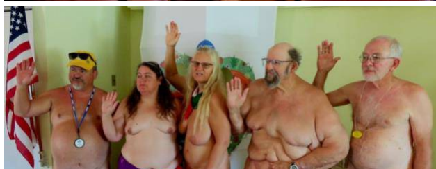
Above: newly elected members of the Board of Directors are sworn in.

A third workshop looked at the challenge of getting clubs to align with the AANR policy of no discrimination against persons based on gender, race, sexual orientation, or marital/relationship status. The consensus reached was that inappropriate behavior needed to be the basis for exclusion or removal instead of excluding a potential guest based upon gender. The right of members to be safe in their own personal space from boorish behavior was also discussed. The workshop was extended by 30 minutes due to the interest. We decided to run the same workshop at next year's convention to continue the conversation due to its cultural relevance