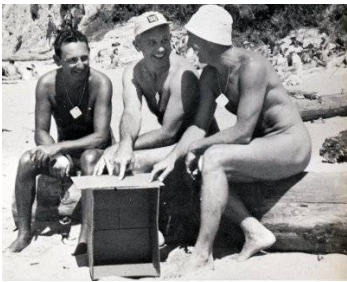
XB58 Beach, June 1958