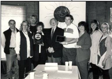
1995 Topanga Chamber of Commerce Citizen of the Year.

social nudity, prevailing with a Conditional Use Permit granted in 1992. His tenacity led him to challenge and to overturn in the courts the arcane 1939 Anti-nudity Ordinance in Los Angeles which stated no three people could be seen together if all were naked.