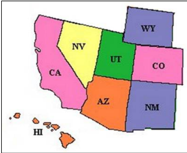
The AANR-West region covers eight states and western Mexico.