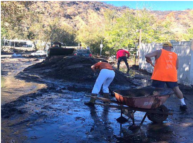
The view of the mud and debris along Low Road near Indian Creek.