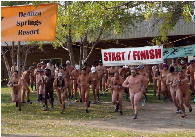
Ready! Set! Go! And they're off at De Anza!