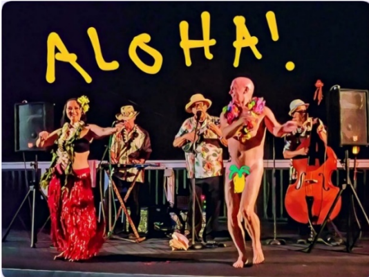
Guests were invited to learn the hula and other Polynesian dances at the September 5 Luau and Polynesian Festival at Olive Dell Ranch.

On October 30 the park will host a Halloween dance party with the usual costume contest. The park kids will trick or treat earlier in the evening. Our usual fun times!