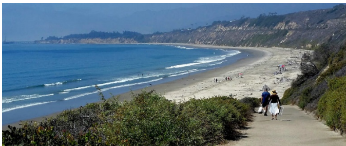
A beautiful morning at Bates Beach Sept 18 for the annual cleanup and group picnic.